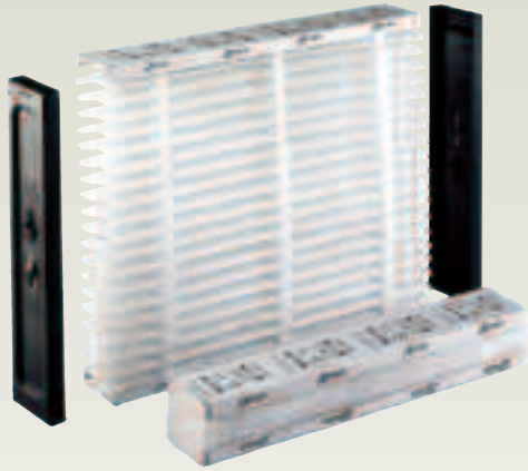
EZ Flex Filter