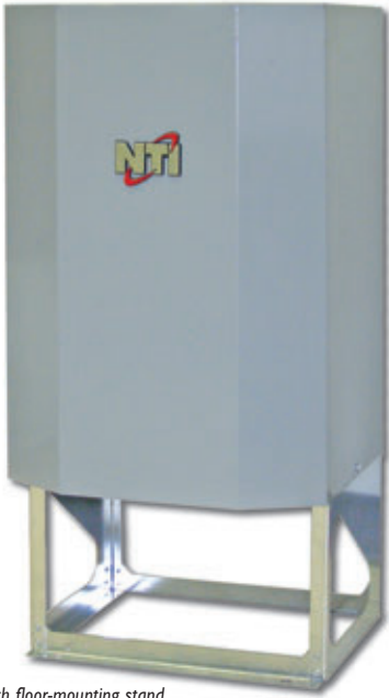
Ti-150 with floor-mounting stand