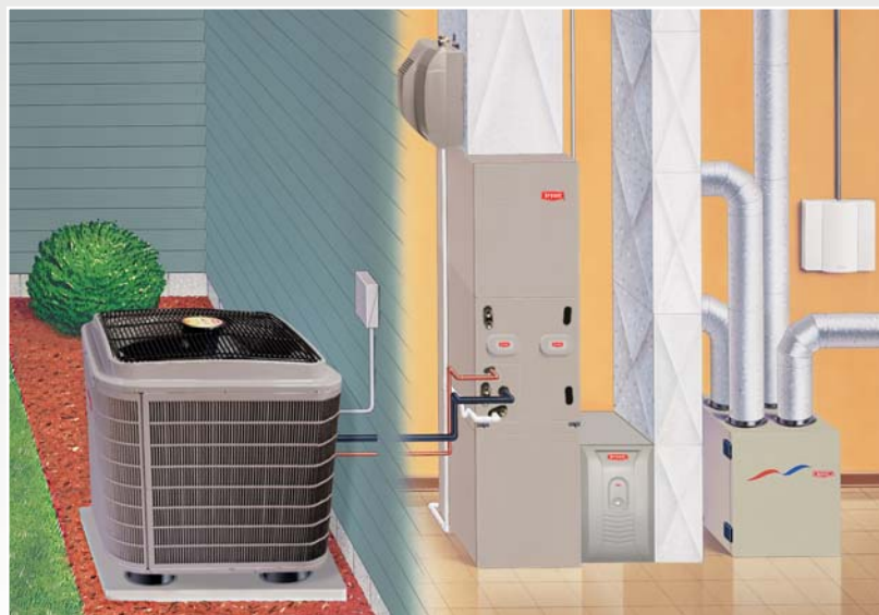
Heat Pump and Fan Coil System