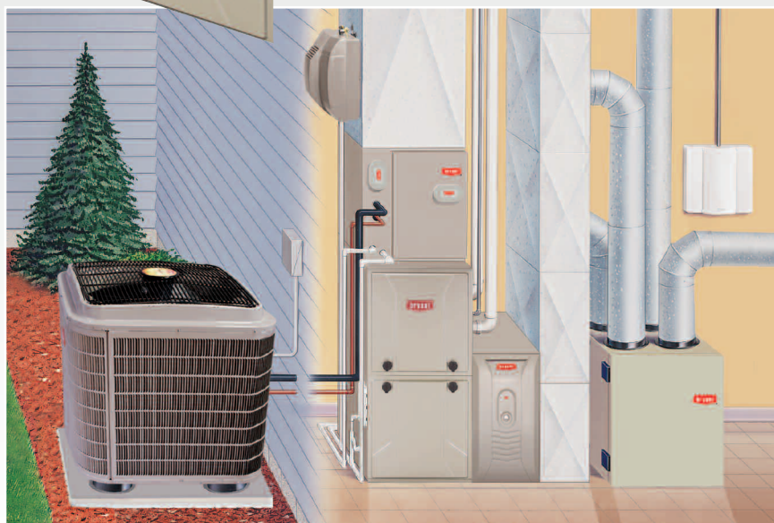
HYBRID HEAT® Deluxe Heat Pump and Deluxe Gas Furnace System